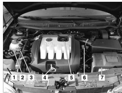
1.9L PD engine bay (code: BEW) 0 Maintenance