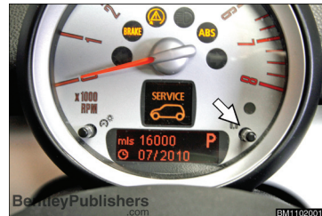
Step-by-step instructions for resetting CBS service items. 020 Maintenance