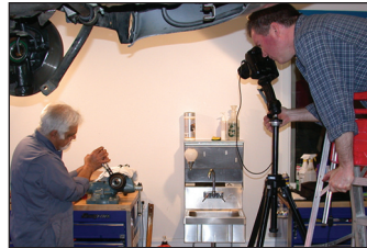
Bentley technical editors photographing axle boot replacement.

Bentley repair manuals provide the highest level of clarity and comprehensiveness for service and repair procedures. If you're looking for better understanding of your C5 platform Audi A6 or S6, look no further than Bentley.