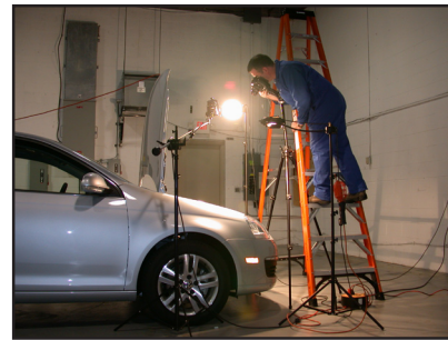
Technical photography session

Bentley repair manuals provide the highest level of clarity and comprehensiveness for service and repair procedures. If you're looking for a better understanding of your 2006 through 2009 Rabbit or GTI, look no further than Bentley.