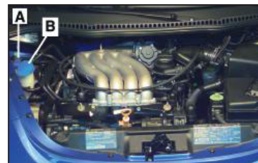
See how to perform routine maintenance procedures, such as checking fluids. 03 Maintenance