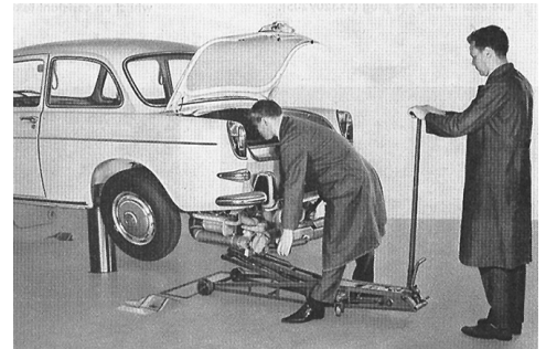
Engine Removal and Installation, Section M, Engine and Clutch