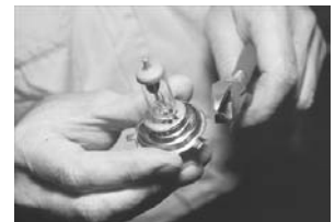
Convert your headlights to European standard H4 halogen lights. Chapter 12: Performance and modification