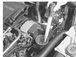
Although exceptionally strong and reliable, E-Class cars need regular maintenance, such as power steering fluid and filter replacement. Chapter 3: Maintenance