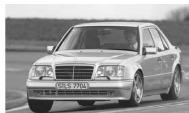
From the limited production E500 supercar to the utilitarian 300TE 4MATIC, the Mercedes-Benz E-Class Owner's Bible™ will enhance your ownership experience