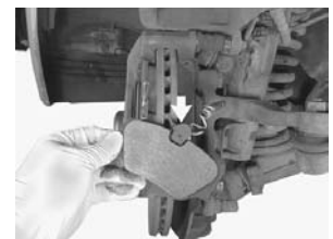
Follow step-by-step procedures for brake pad and rotor replacement. Chapter 3: Maintenance