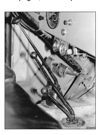
Fig. 10-24. Mechanical clutch linkage requires regular inspection for wear and excessive play. Models with through-thefloor pedals have the advantage of chassis mounted linkage. This reduces the tendency to flex, distort and bind. From Chapter 10 - Clutch and Transmission Service

504 pages, 920 b/w photos and illustrations