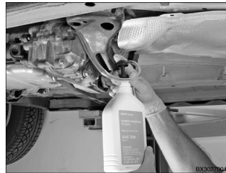
Learn how to change the transfer case fluid and reset xDrive transfer case adaptations. 270 Transfer Case