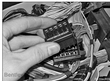
Extensive electrical component location information. ECL Electrical Component Locations