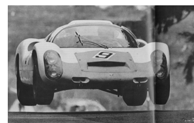
Chapter 19: The Stommelen/ Ahrens Type 910 jumps at Brunnchen on the 'Ring in 1967.