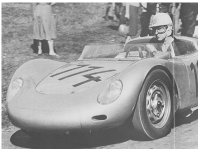
Chapter 10: Wolfgang von Trips in a modified 1957 works RSK at the 1958 Gaisberg, Austria, hillclimb.