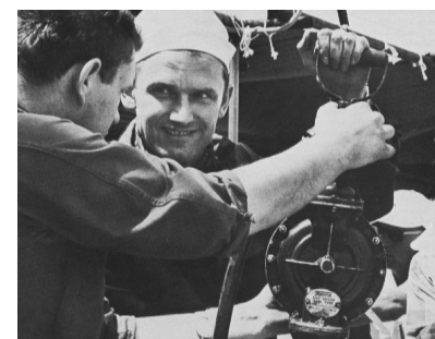
Chapter 17: Ferdinand Piëch, grandson of Ferdinand Porsche and nephew of Ferry Porsche, was the motivating spirit behind the creation of the Type 906 or Carrera 6.