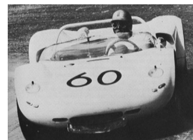
Chapter 15: Gerhard Mitter placed second at Freiburg in August 1965 with the white 904/8 Spyder.