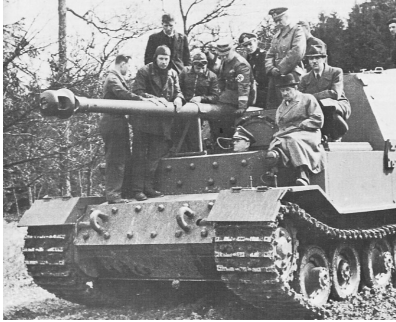
Chapter 1: The “Ferdinand” tank with Ferdinand Porsche on board and Albert Speer at the controls.