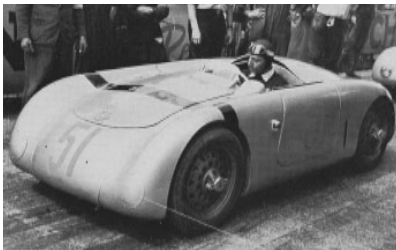
Chapter 6: The first Glöckler special at Freiburg in 1950.