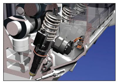
Pumpe Düse pump injector

1872 pages, 4445 photos, illustrations and diagrams Includes a 32 page color Passat Familiarization section