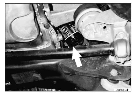
Engine oil and filter changing procedures, including filter . location Section A - Maintenance