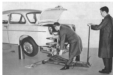
Engine Removal and Installation, Section M, Engine and Clutch