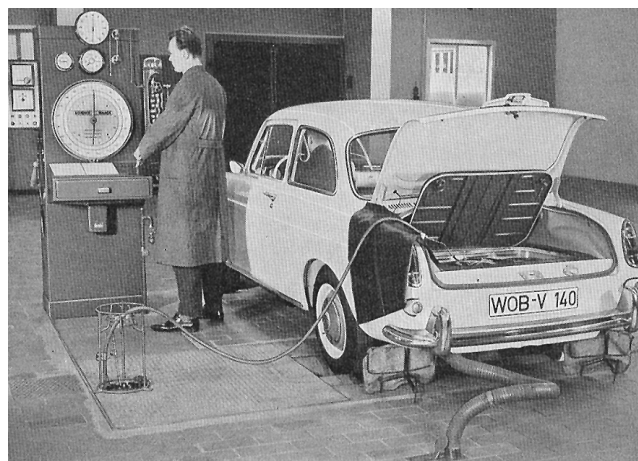
Checking Fuel Consumption, Section K, Fuel System