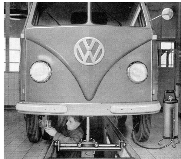
Brake Bleeding, Section B, Brakes, Wheels, and Tires

www. BentleyPublishers.com • email: sales@bentleypublishers.com