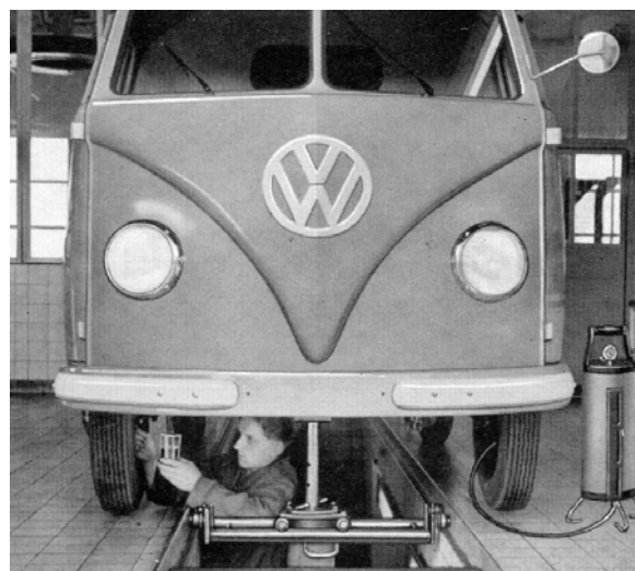
Brake Bleeding, Section B, Brakes, Wheels, and Tires