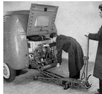
Engine Removal and Installation, Section M, Engine and Clutch