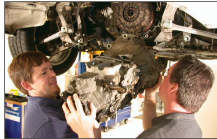
Bentley technical editors lowering Boxster transmission.

Bentley repair manuals provide the highest level of clarity and comprehensiveness for service and repair procedures. If you're looking for better understanding of your Boxster, look no further than Bentley.