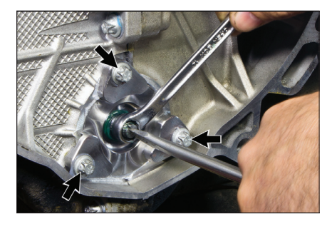
Intermediate shaft (IMS) bearing replacement. 15 Cylinder Head

Price: $219.95 Bentley Stock No: P905 Publication Date: 2012-10-01 ISBN: 978-0-8376-1710-7 Hardcover, 8 3/8 in. x 11in. Case quantity: 5 1,024 pages 1,477 full color photos and illustrations