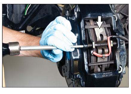
Step-by-step brake pad, pad sensor and rotor replacement. 46 Brakes-Mechanical

Engines covered: 1999-2001: 3.4 liter (M96.01, M96.02, M96.04) 2002-2005: 3.6 liter (M96.03)