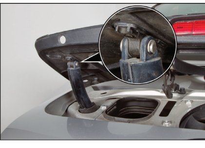
Diagnosis and repair information for the power rear spoiler. 55 Trunk Lid, Engine Hood