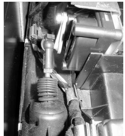
Air-conditioning and heating system specifications, description, repair procedures. Mixing chamber servo, valve, actuator