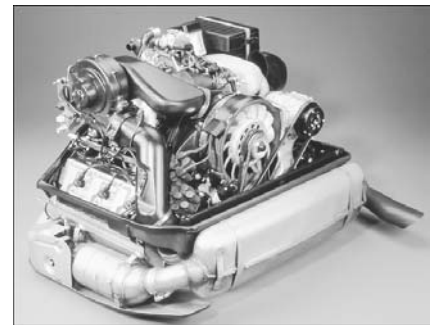
Engine applications and technical details for all models. 3.6 litre M64/1 engine from 1989 Carrera 4

Retail price: $69.95 Publication date: 2003.dec.8 Bentley stock no. GP64 ISBN 0-8376-0293-9 638 pages, over 1130 photos, illustrations, and diagrams softcover, 8 3 / 8 " x 11"