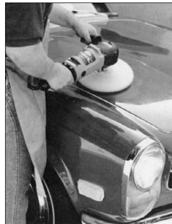
How to wax your car like the pros from Chapter 9 Care and Preservation