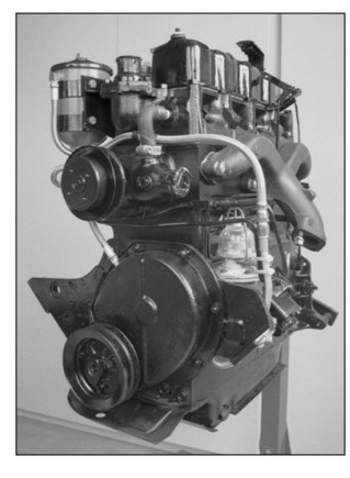
Engine Rebuilding is covered in chapter two.

10. Accessories and Safety Equipment Appendix