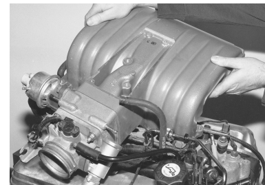
Fig. 20-3. Shown during disassembly, this H.O. upper intake section still has its EGR spacer, throttle body, throttle position sensor, and EGR valve attached. Note the two center attaching bolt bosses normally hidden under the top cover plate.