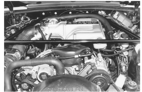
Fig. 29-1. Adding braces can help stiffen the front-end and the entire car.

Retail price: $34.95 Bentley Stock No: GFM5 ISBN: 0-8376-0210-6 Ford Racing Part No. M-1832-Z4 440 pages, 272 photos Softcover 7-7/8" x 10-3/8"