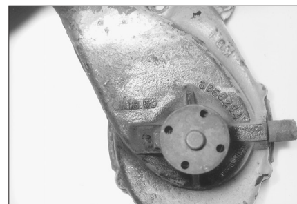
(1) Overall view of #3703524. (2) This photo shows the casting number H 18 5 (Aug. 18, 1965). Most Corvette water pumps use these types of casting dates.

Corvette by the Numbers ™ is the only authoritative reference for identifying and verifying, by casting number, the correct engine and drivetrain parts for your exact model Corvette. From the author of the highly acclaimed Chevrolet by the Numbers ™ book series, Corvette by the Numbers ™ documents part casting numbers and applications using original source material from General Motors Archives. No other book has this authoritative factory information, including photographs, engineering blueprints, technical service bulletins, and build sheets.