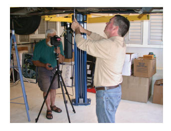
Bentley technical editors documenting fuel filter replacement.

Price: $129.95 Bentley Stock No: BX56 Publication Date: 2008.feb.15 ISBN: 978-0-8376-1643-8 Hardcover, 8 3/8 in. x 11 in. Case quantity: 5 over 1240 pages, over 2100 photos, illustrations and diagrams