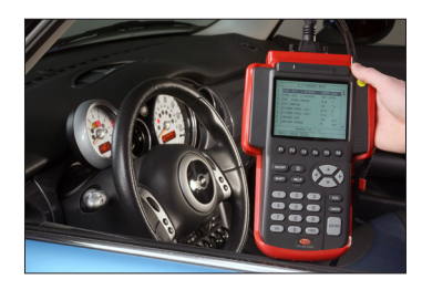
An OBD-II scan tool is invaluable for on-board diagnostics, such as clearing fault codes, and resetting the Check Engine light. OBD On-Board Diagnostics

Price: $59.95 Bentley Stock No: BMD6 Publication Date: 2009.mar.02 ISBN: 978-0-8376-1571-4 Softcover, 7 in. x 9 in. Case quantity: 10 336 pages 306 photos, illustrations and diagrams