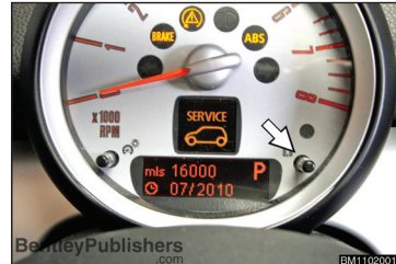
Step-by-step instructions for resetting CBS service items. 020 Maintenance