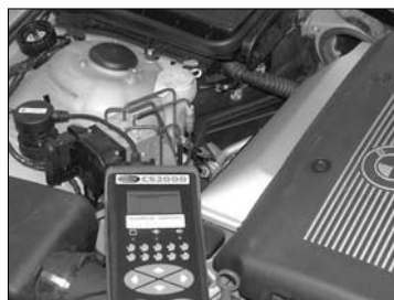
Access Diagnostic Trouble Codes (DTCs) to diagnose engine management problems. 130 Fuel Injection

Price: $169.95 Bentley Stock Number: B502 ISBN: 0-8376-0317-X Publication Date: 2003.oct.1 Editorial Closing Date: 2003.aug Two volumes containing 2150 pages 1165 photos and 1125 illustrations Softcover 8 1/2 in. x 11 in.