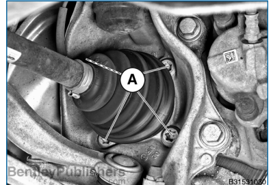
Drive axle, driveshaft and wheel bearing service. 260 Driveshafts, 310 Front Suspension, 330 Rear Suspensions

130 Fuel Injection (N20, N26, N55 engine)