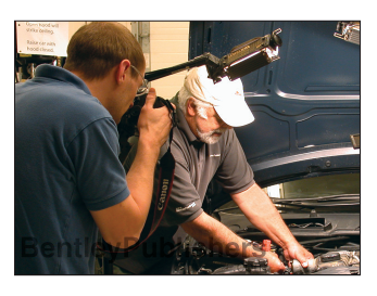
Bentley technical editors removing Valvetronic motor on N51 engine.

Normally aspirated models (6-cylinder 3.0 engines)