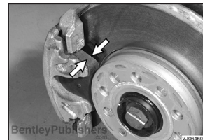
Preventative maintenance procedures, including brake system inspection and service 03 Maintenance