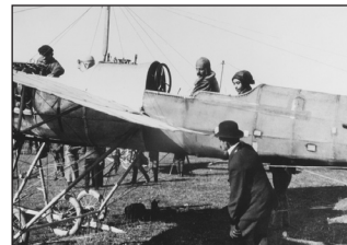
Chapter 8 Opportunity in the Air 1909-1918: In his characteristic bowler, Porsche observed a flight test with one of his engines on the Steinfeld in 1911.