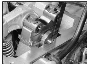
Measuring camshaft axial play. 116 Cylinder Head and Valvetrain

Includes complete text of the MINI Cooper - Diagnosis Without Guesswork: 200-2006 diagnostic trouble code manual