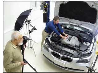
Bentley technical editors removing motor cover on V8 (N62) engine.