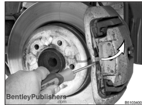
Detailed brake pad and rotor service. 340 Brakes